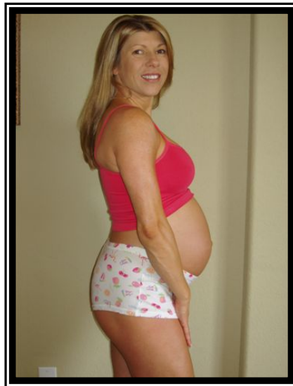
Here I am at 9 months pregnant – week 41